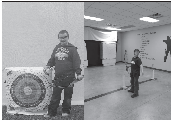
Fifth graders participated in archery classes while at Eagle Bluff Environmental Learning Center in Lanesboro in October.